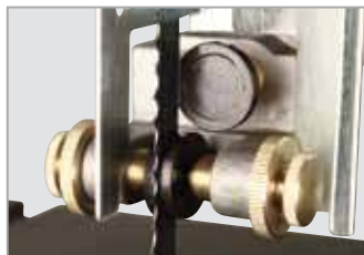
Tempered 3-roller precision guiding above and under the table.