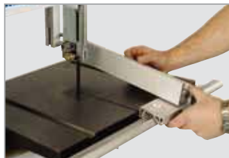
Precision ripping fence with magnifying glass, to be inserted from above.