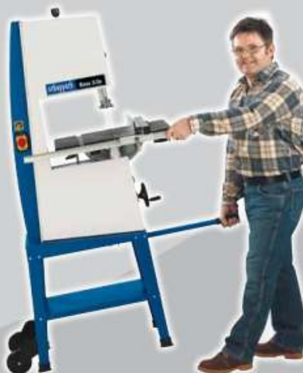
Illustration shows optional equipment available at extra cost.

Set of sanding belts 3 pieces each grit 60 Order no. 73190711 grit 120 Order no. 73190712