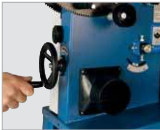
Unique vario drive, continuously adjustable by hand wheel.