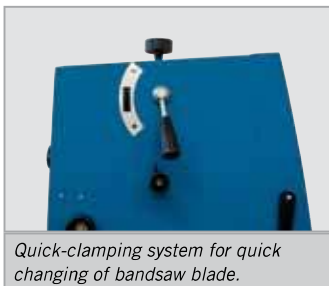
Quick-clamping system for quick changing of bandsaw blade.