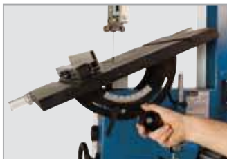
Table inclination setting by hand wheel, possible with one hand.