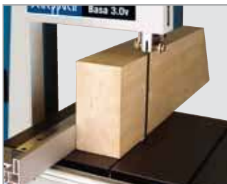
Impressive passage height of 205 mm, and passage width of 306 mm.