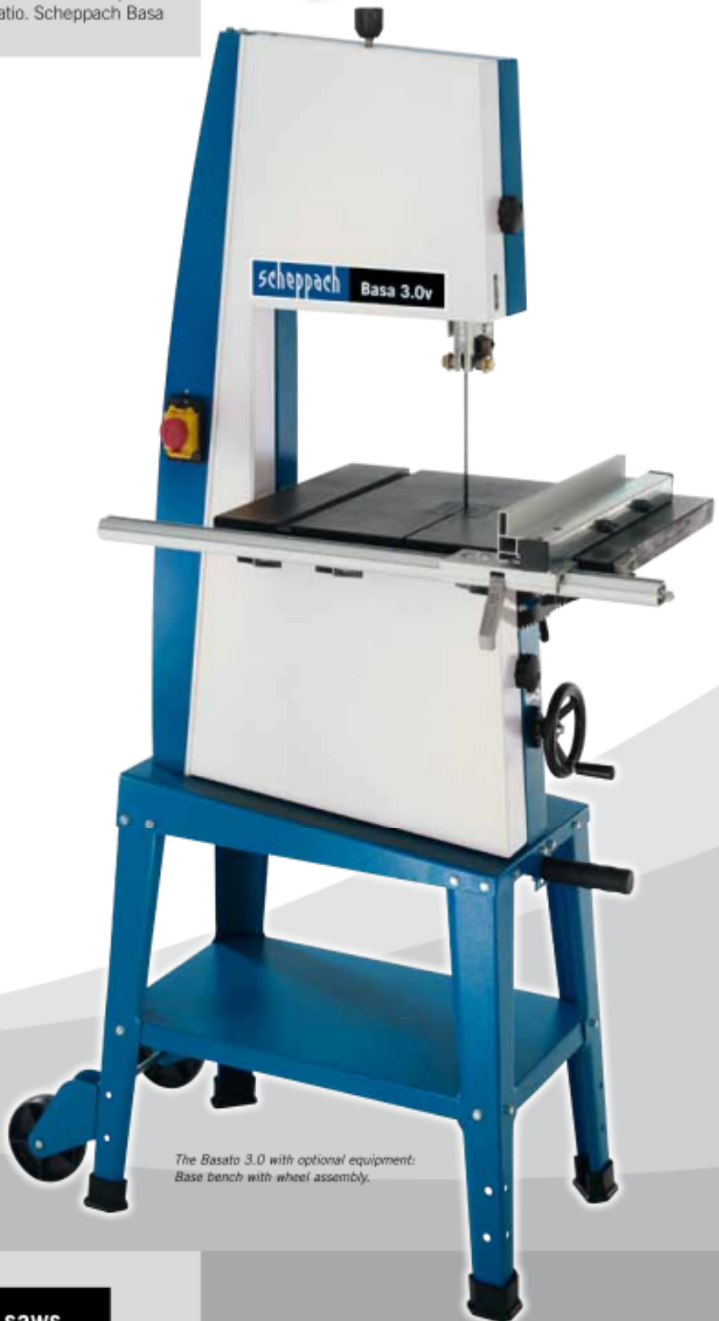
The Basato 3.0 with optional equipment: Base bench with wheel assembly.