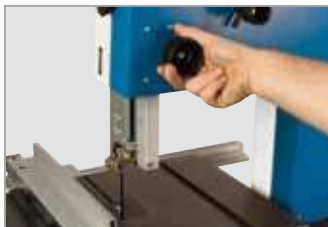
Cutting height adjustment by hand wheel.